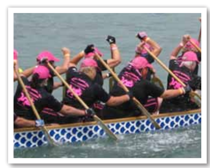
Pink Dragons - Dragon Boating team.